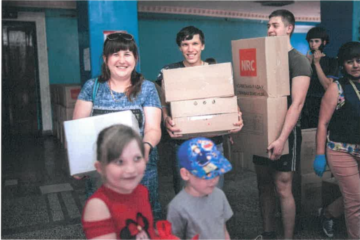
A family receiving a monthly food package and a household hygiene package from our teams, in cooperation with local partners, in Ukrainian city Myrnohrad.

We also provide cash in areas where the local markets are functional, so people can make their own decisions on purchases, based on their needs, while also supporting the local economy.