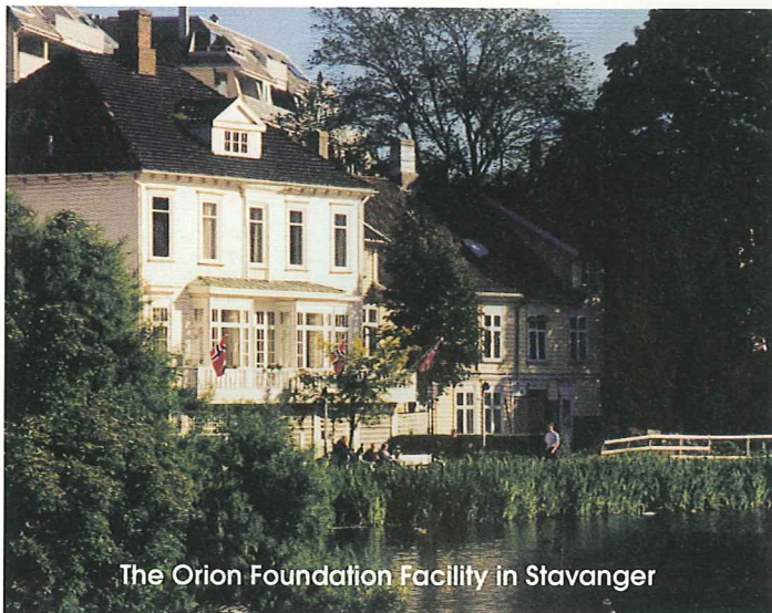
The Orion Foundation Facility in Stavanger

The Orion Foundation is an institution established to develop and strengthen mutual interests between Stavanger, Western Norway and North America. Orion incorporates an information and cultural center, provides educational assistance and other programs. Orion has made its administrative assistance available to AmCham in order to coordinate events of mutual interest.